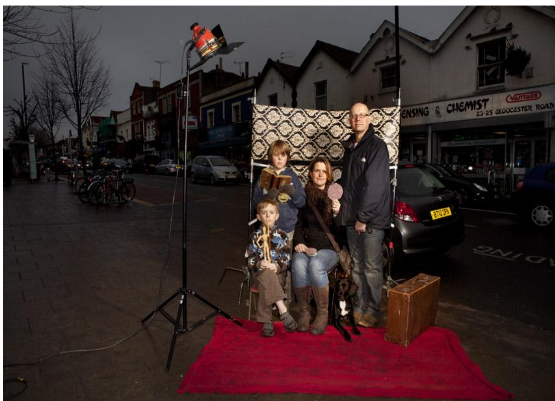
Fig. 3: the Jutton Family in Still Image Moving (2010). Courtesy of the Jutton Family and Manuel Vason.

of the participant's subjectivity, even when the artist asks them simply to be themselves' (Beech, Include Me Out! n.p.). Still Image Moving dealt with this issue in a positive way, by allowing the participant to contribute to different capacities, with a team of artist facilitators to assist. This collaborative act attempted to hand over agency and, significantly, offered ownership of the image to the participant. Still Image Moving had a large opening in the work for the participant to make decisions about the concept, framing and content of the image whilst attempting to create a flexible situation. This resulted in a range of images that were a collaborative effort between the artist(s) and the participants, with the minimum amount of prescribed parameters. The collaboration, and with it the promise of authorship, agency and ownership, lay in the decision-making process. This is where potential agency is created, by offering the opportunity to take decisions on the content, subject and location of the photograph created.